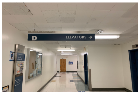
Hallway leading to D Elevators