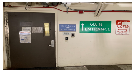
Main entrance door from parking to CHS building